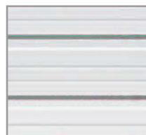
Ribbed Panel Design