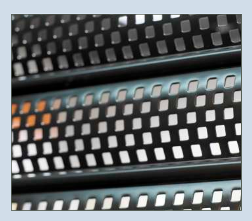
The P-51 perforation shown above is one of three available patterns.

Store owners have peace of mind while working late hours.