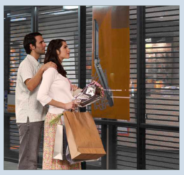
Perforated slats keep your signage and displays working for you. - Security with Vision <sup>™</sup>