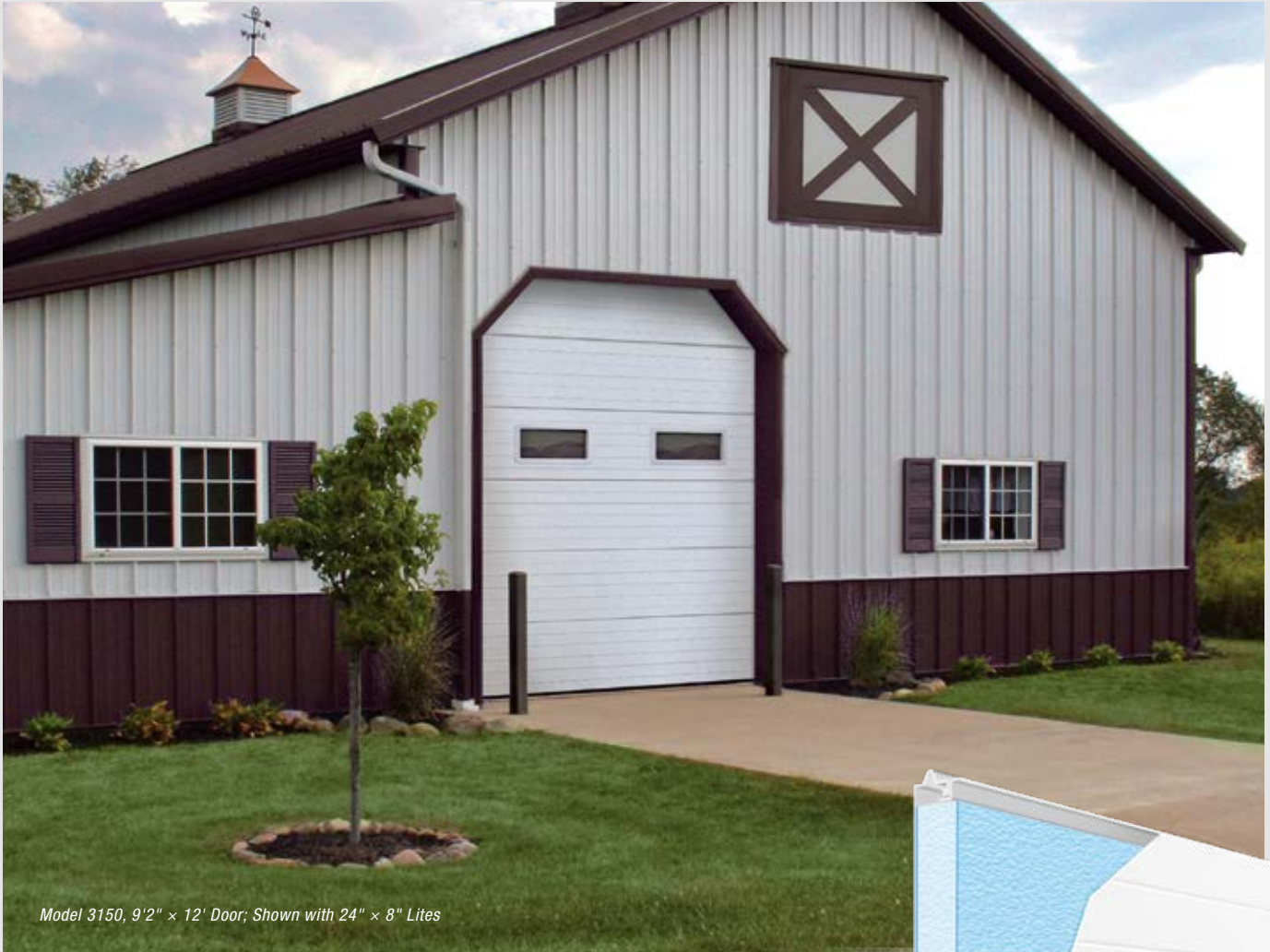
Model 3150, 9'2" x 12' Door; Shown with 24" x 8" Lites