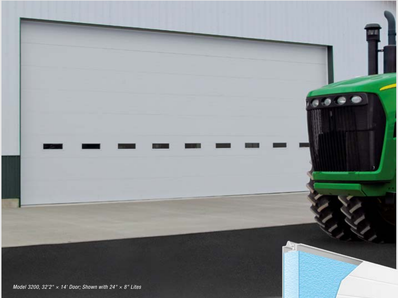
Model 3200, 32'2" x 14' Door; Shown with 24" x 8" Lites