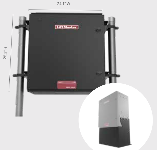
MRIN Mounting Accessory

The LiftMaster® Heavy-Duty Industrial Slide Gate Operator builds on the brand's legacy of reliability. With the strength to effortlessly move 5,500-pound gates, the operator allows Facility Managers to focus on everyday responsibilities without worrying about failure or frequent maintenance. Easy to install, retrofit, program, and troubleshoot, it delivers worry-free continuous-duty operation-even in extreme weather conditions. The operator consistently lives up to the tireless demands of manufacturing, transportation, municipality, utility and warehouse environments. It also works as a complete system when paired with safety devices and offers full control over access points via myQ® technology.