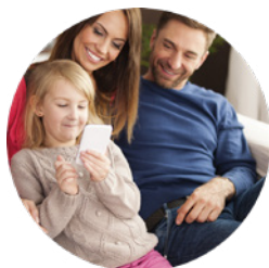
VIDEO OF VISITORS